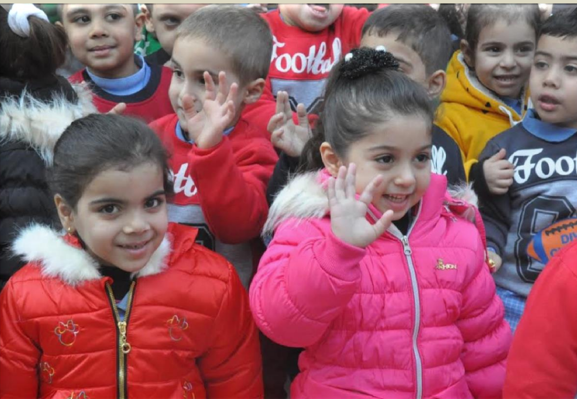
Beit Atfal Assumoud newsletter is published monthly by the National Institution of social Care and Vocational Training. Each letter is issued to circulate information about the work and activities of the institution and its centers over the course of the month. We have been working on providing services for Palestinian refugees living in the camps of Lebanon for 39 years.